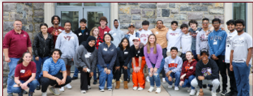
Pathways Fall Visitation Students 2022